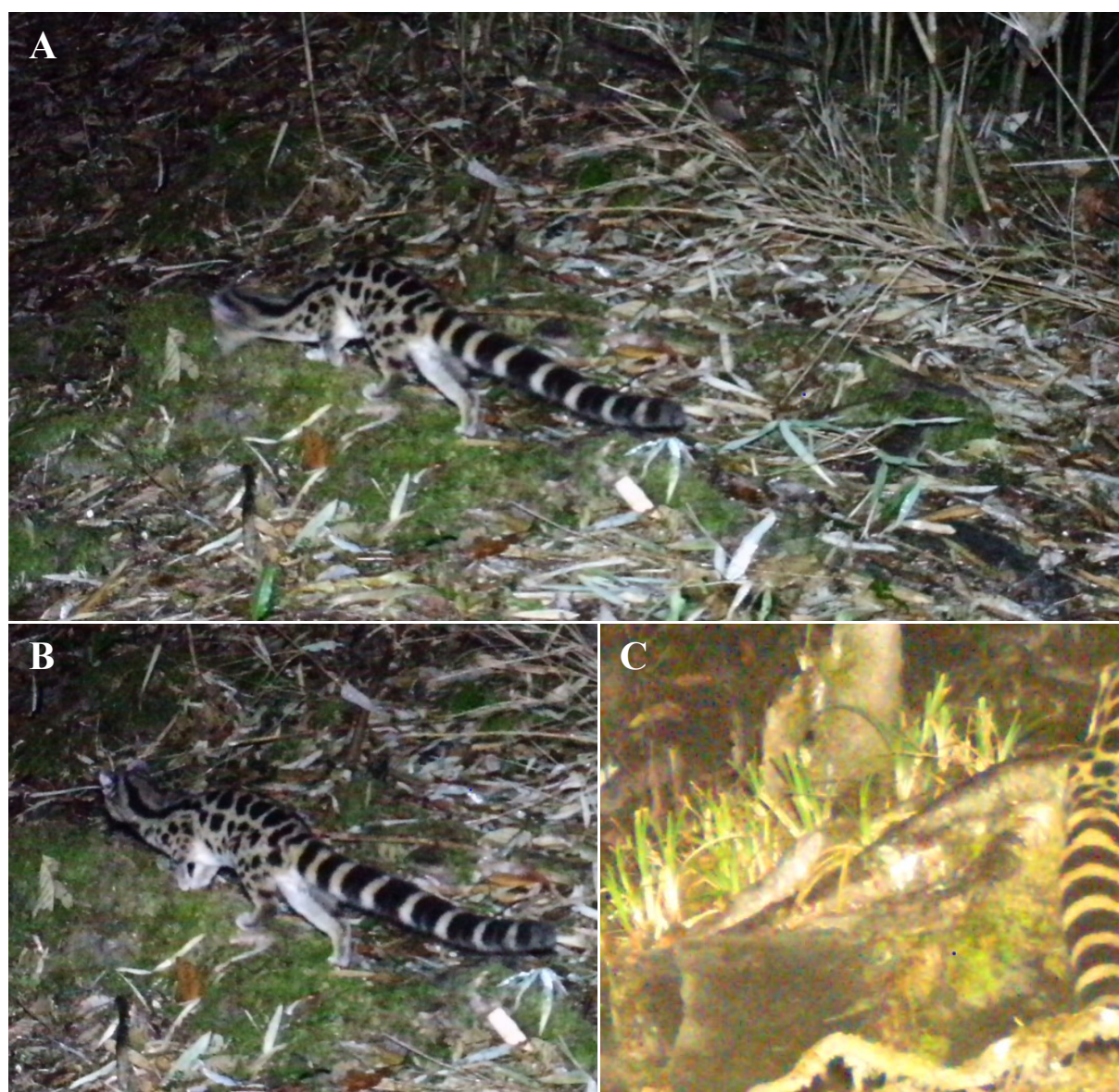
Figure 2: Camera-trap images of the Spotted linsang Prionodon pardicolor from the Tashigang Forest Division, recorded in 2014–2015 (a, b), and 2020 (c).

In Bhutan, P. pardicolor is so far known from only few locations, most commonly in the western region. During a tiger inventory in the Jigme Dorji National Park (2011–2012) in northwestern Bhutan by Thinley et al. (2015), a single image of P. pardicolor was recorded at elevations between 2,063 and 4,105 m a.s.l. in mixed-conifer forests. Later, during the NTS (2014–2015), the species was recorded at two different locations in the Gedu Forest Division in southwestern Bhutan, at elevations between 2,150 and 2,718 m a.s.l. in cool broadleaf forest with sparse stands of Rhododendron arboretum (Dhendup and Dorji, 2018). These findings indicate that cool broadleaf forest and mixed conifer montane forest of Bhutan support significant habitat niches for such rare species and important wildlife corridor to the larger landscape of the eastern Himalayas.