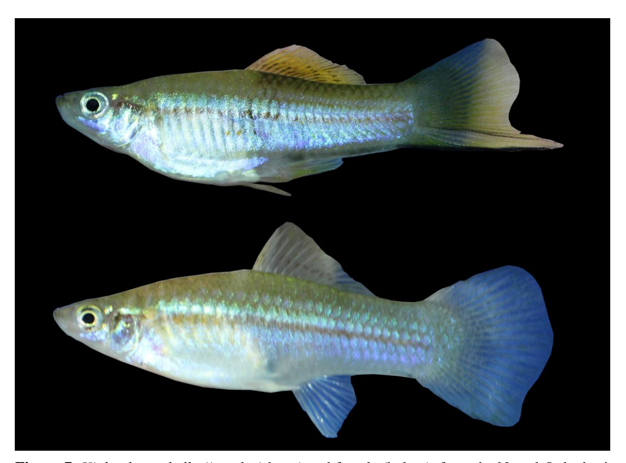
Figure 7: Xiphophorus hellerii : male (above) and female (below), from the Namak Lake basin, Iran.