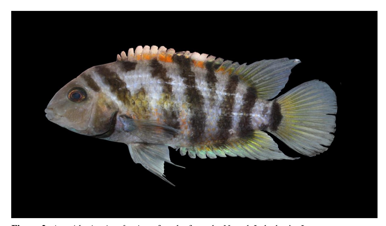
Figure 2: Amatitlania nigrofasciata: female, from the Namak Lake basin, Iran.