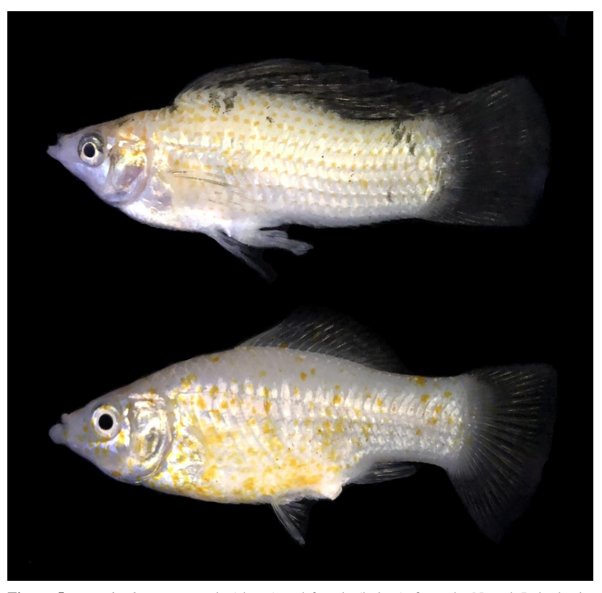
Figure 5: Poecilia latipinna : male (above) and female (below), from the Namak Lake basin, Iran.

Distribution in Iranian water basins: A single specimen of Atractosteus spatula was reported from the Marivan (Zarivar) Lake, in the Tigris River drainage, the Persian Gulf basin (Esmaeili et al., 2017).