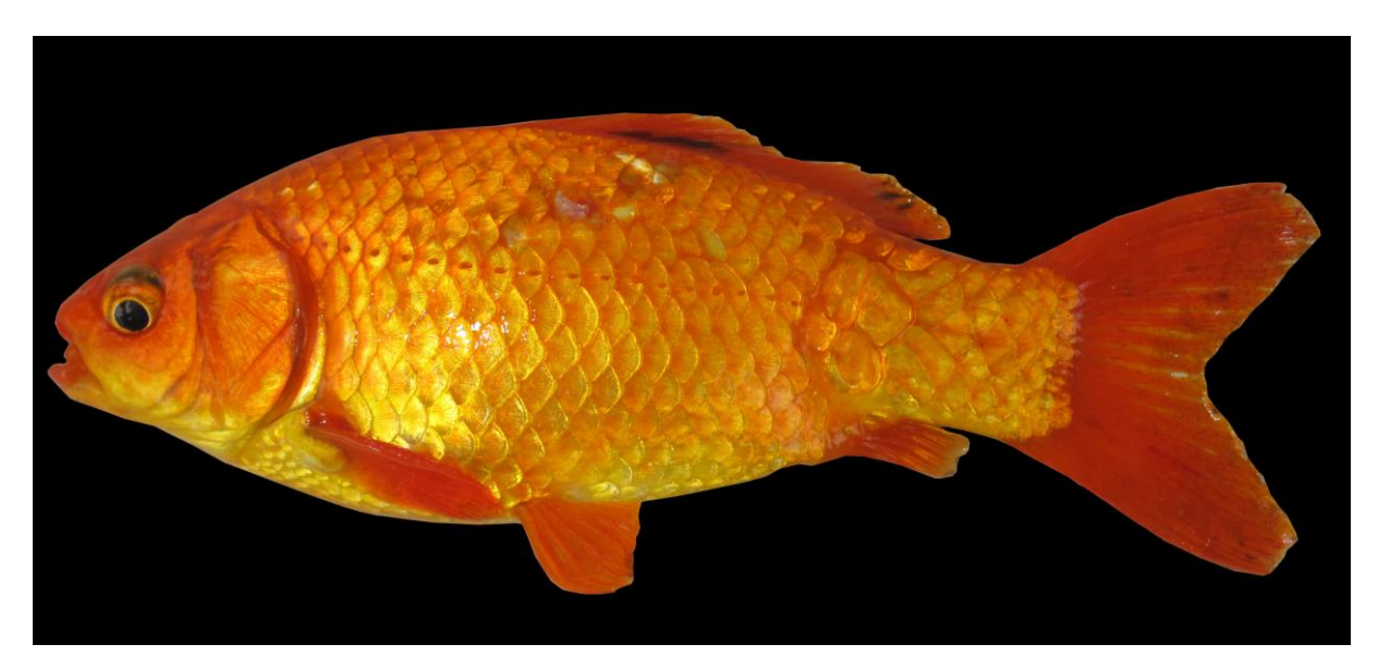
Figure 3: Carassius auratus, from the Tigris River basin, Iran.