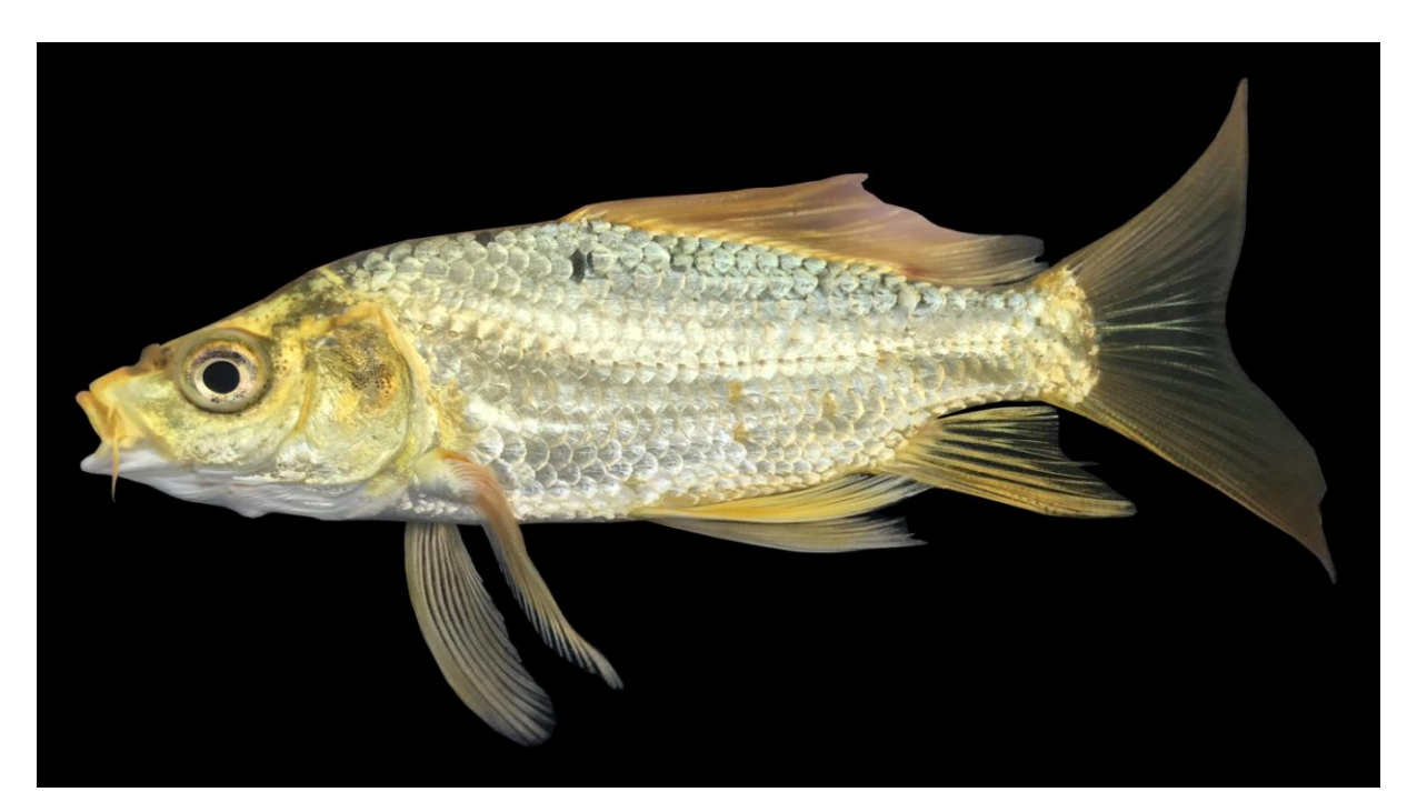
Figure 4: Cyprinus carpio, from the Namak Lake basin, Iran.