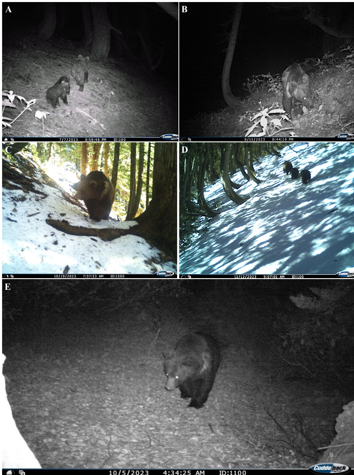
Figure 2: Camera trap images of Himalayan brown bear captured in different grids in Bani Wildlife Sanctuary, (A) an adult female with two cubs near Heiu Nallah (grid-27, 2567 m asl), (B) another adult between Thalli Nallah Forest and Somphu Forest (grid- 27, elevation 2754 m asl), (C) an adult in Dhanbiyal (grid-22, elevation 2765 m asl), (D) an adult female with two cubs in Chattri (grid-7, elevation 3465 m asl), Sudhmahadev Conservation Reserve, and (E), a sub-adult near Seoj Dhar (Sudhmahadev CR, grid-62, elevation 3230 m asl) Jammu and Kashmir, India. All images are the photo captures triggered by IR cameras.