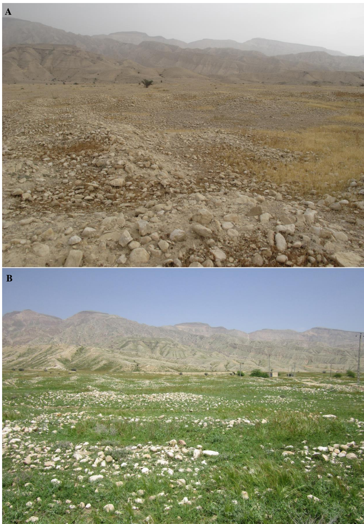
Figure 6: New locality record of Hemiechinus auritus , in hillside of the Varavi Mountain, northeast of Varavi city, southwest of Fars Province in March 2016 (A) and the same habitat in April 2019 (B), respectively.