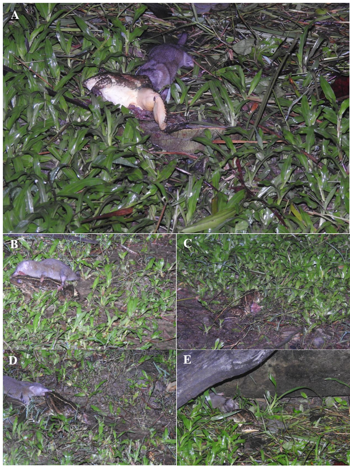
Figure 2: Observations on Suncus murinus feeding on Hoplobatrachus tigerinus : the shrew chewing on the frog (A), the shrew grabbing the frog and further chewing (B), when disturbed by the light the shrew left the prey (C), the shrew started dragging the frog towards a hideout under some wood (D and E).